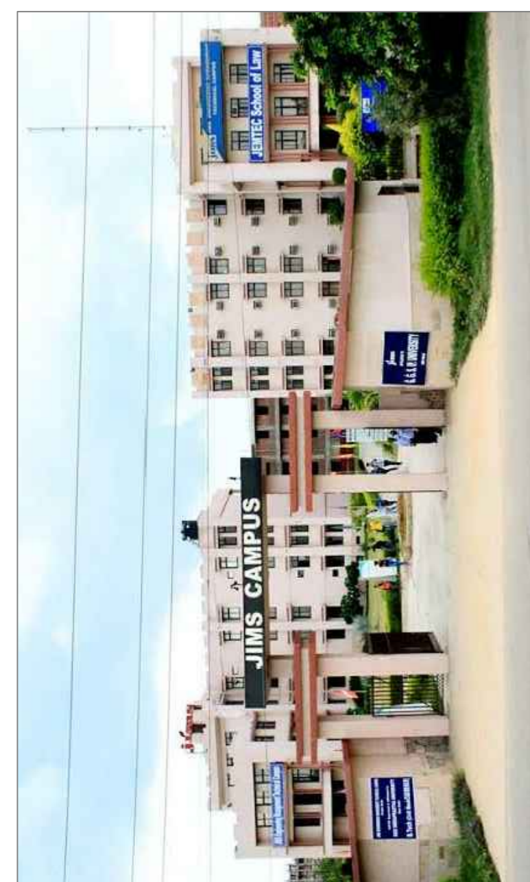
JIMS ENGINEERING MANAGEMENT TECHNICAL