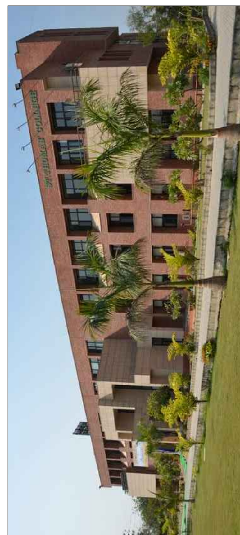
ST. THOMAS COLLEGE OF EDUCATION